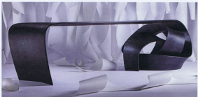
SHOWN: GILL; FISH: GILL; WALSH: SARAH MYERSCOUGH

Fish's source of inspiration is the anatomy of leaves – the way a leaf displays its midrib and veins like a skeleton when held to the light. Another branch of creative reference the natural form of the wood. The Palm bench (2018, £7,500) by Charlie Whitney Studio is a steam-bent and carved ash seat in the shape of a mini palm tree, while Matthias Bengtsson's Growth Table Maple (2017, €130,000 from Galerie Maria Wettergren) is a computer-generated design resembling the roots of a tree. Added to the mix are the artists who celebrate wood as a solid, substantial construction material. The Pool bench (from $19,440, from Willer gallery) by American artist Ty Brest for Caste Design, influenced by Henry Moore's monumental outdoor sculptures, is an arresting piece – at once refined and rugged. Layered ply is hand-sculpted and sanded to reveal a pattern reflecting the topography of the mountains of Brest's native Montana. Another weighty example is Rasmus Fensholt's solid oak Hyosens bench (2017, €18,000