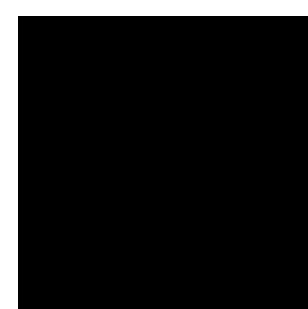
Dawn Alford XXXXXXX