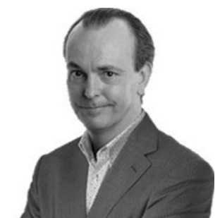
Quentin Willson Britains No.1 Car Journalist